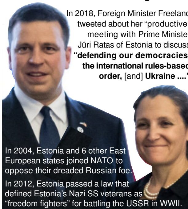
In 2004, Estonia and 6 other East European states joined NATO to oppose their dreaded Russian foe.

In 2018, Foreign Minister Freeland tweeted about her "productive" meeting with Prime Minister Jüri Ratas of Estonia to discuss "defending our democracies, the international rules-based order, [and] Ukraine ...."