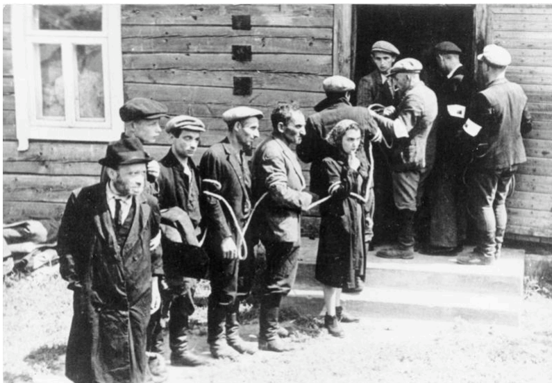
Bild 183-B12290 Juli 1941