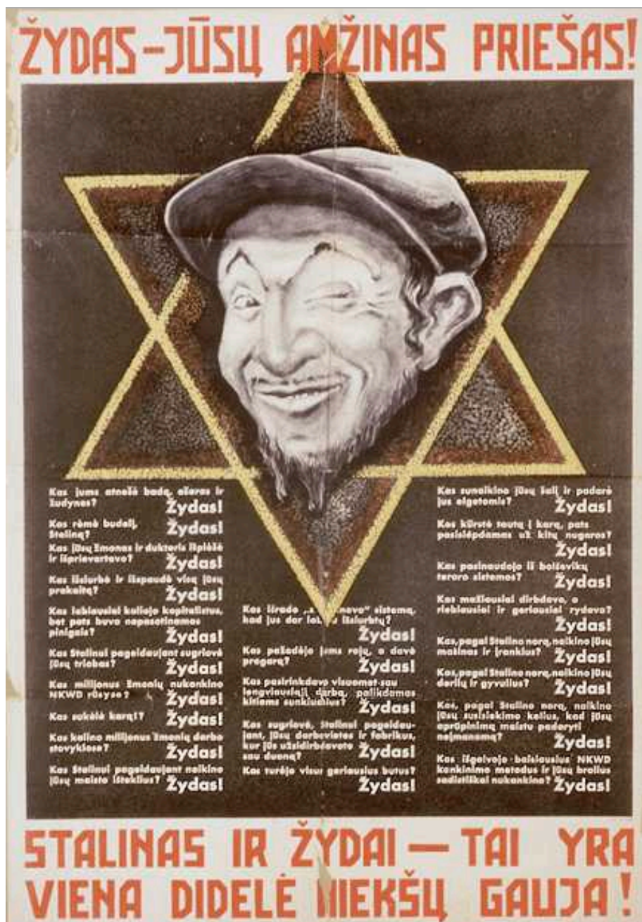
Figure 5: "The Jew - Your Eternal Enemy!" 425