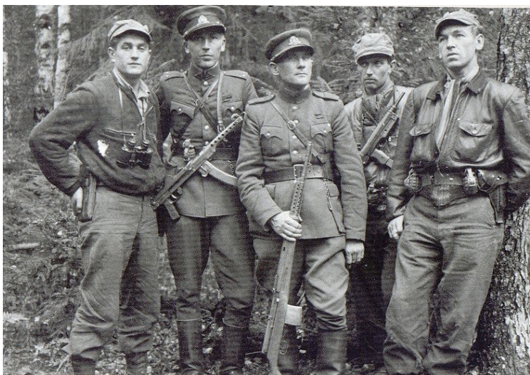
Figure 10: Juozas Lukša (Far Left) with Lithuanian Partisans 441