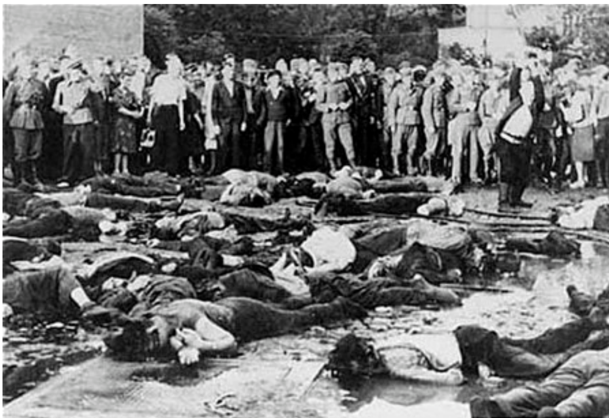
Figure 8: The Death Dealer Delivers A Deadly Blow as German Soldiers and Lithuanian Civilians Watch 439

Jews in Latvia, the former were killed at a rate nearly four times greater than the latter (136,421:35,238).