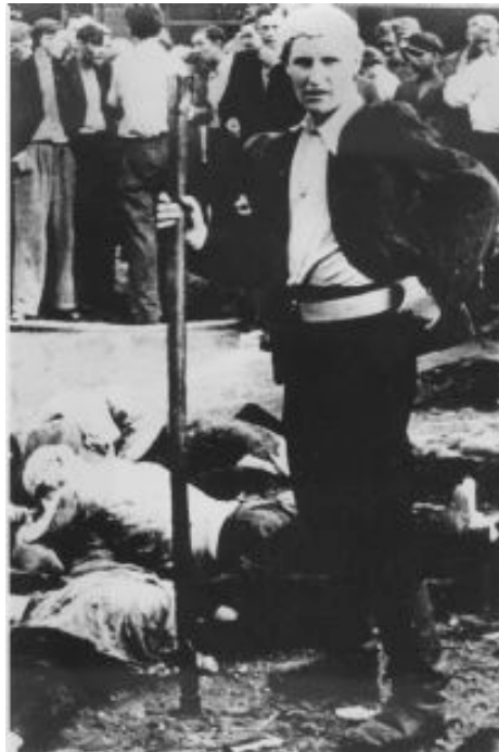
Figure 9: The Death Dealer of Kaunas, 24-28 June 1941 440