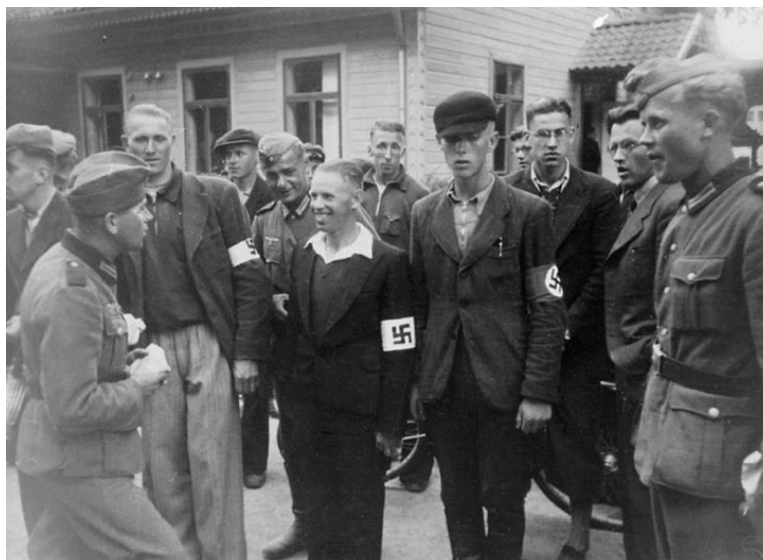
Figure 12: German Soldiers With Lithuanian Collaborators, Summer 1941 443