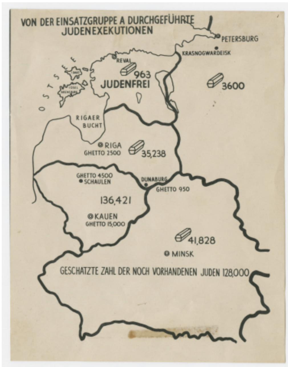
Figure 6: "Jewish Executions Carried out by Einsatzgruppe A " 437