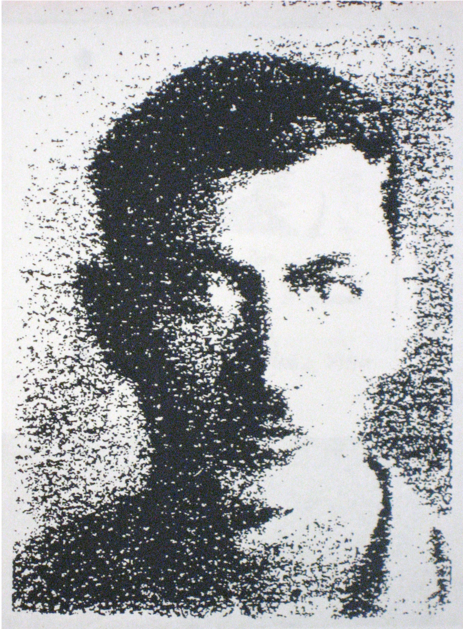
Figure 3: Photograph of Tscherim Soobzokov, CIA Personal File 272